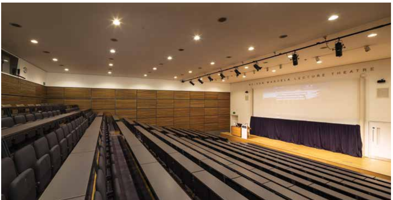
Nelson Mandela Lecture Theatre