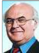
In the industry, Martin Herrenknecht's a legend.

While many in Seattle worry about costs and risks of attempting the world's widest bored tunnel beneath downtown, industry legend Martin Herrenknecht can hardly contain his desire to drill.